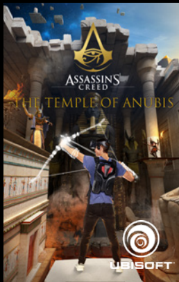
Assassin's Creed by Ubisoft®